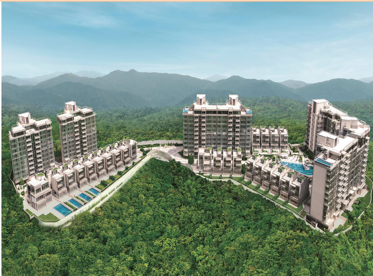
Mount Regalia, a luxurious residential development at 23 Lai Ping Road, Kau To, Sha Tin, New Territories