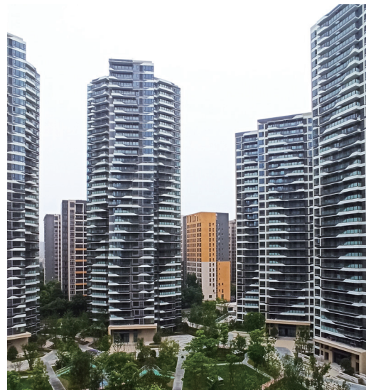
Casa Regalia (Phase 1 and Phase 2), Regal Cosmopolitan City - completed