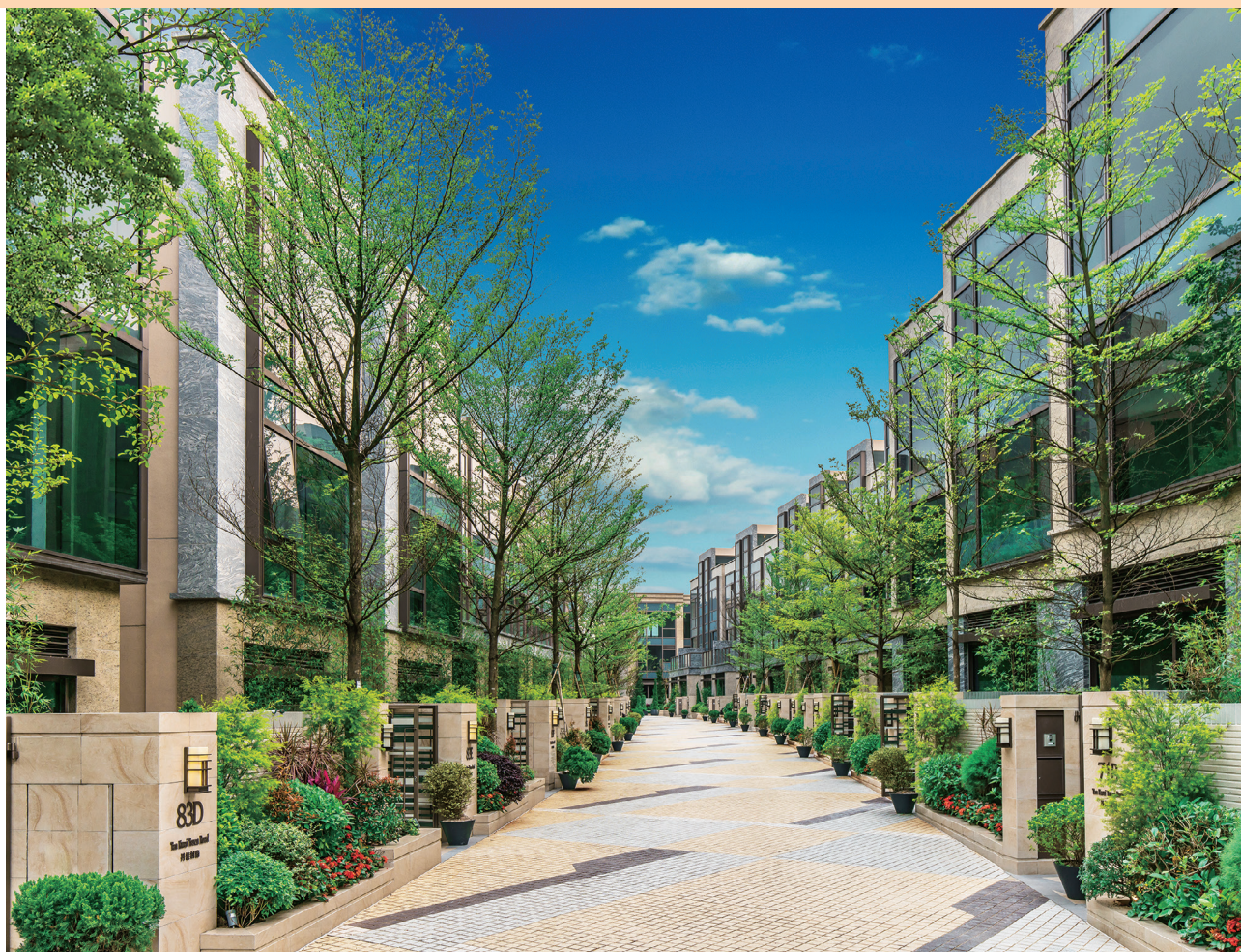
Casa Regalia, the garden houses in the residential development at Nos. 65-89 Tan Kwai Tsuen Road, Yuen Long, New Territories