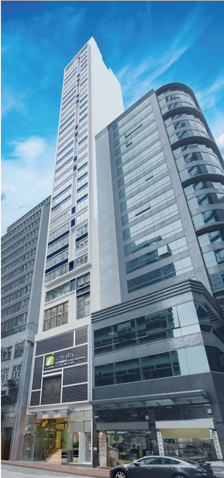
iclub AMTD Sheung Wan Hotel at No. 5 Bonham Strand West, Sheung Wan, Hong Kong