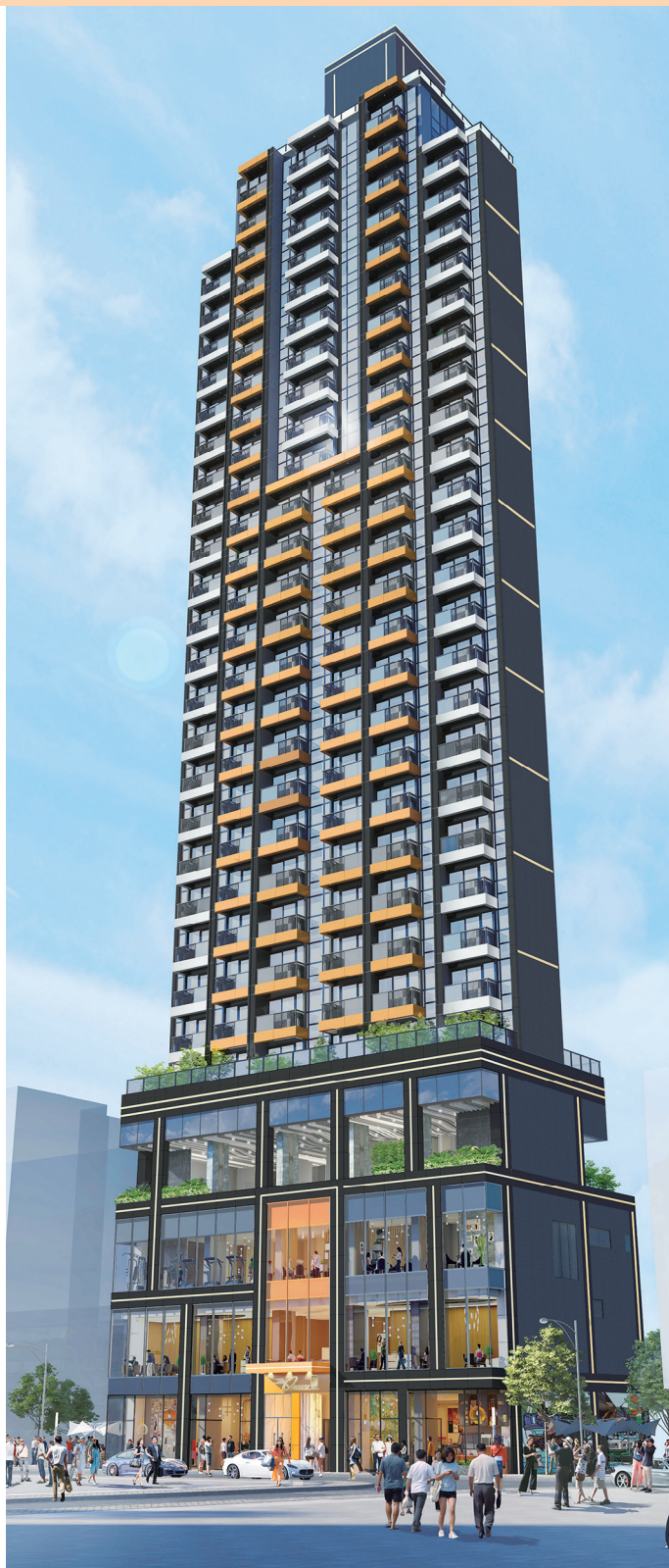
The Queens (*) - a commercial/residential development at No. 160 Queen's Road West, Hong Kong