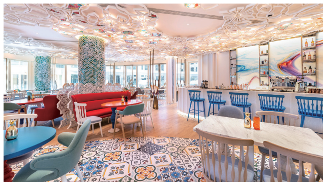
Bar & Grill restaurant - Vivace