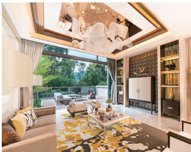
Living room of a garden house