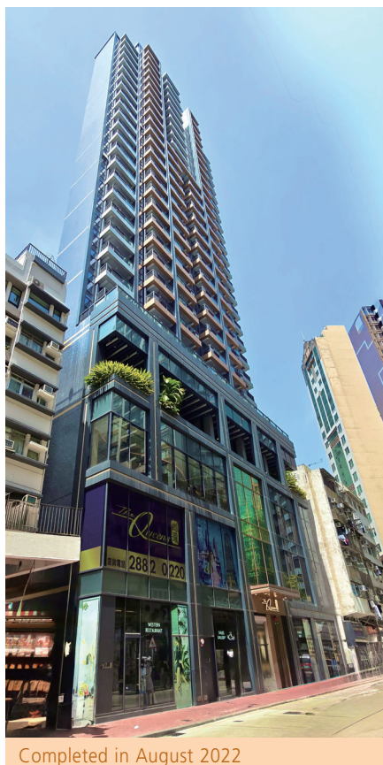
Completed in August 2022