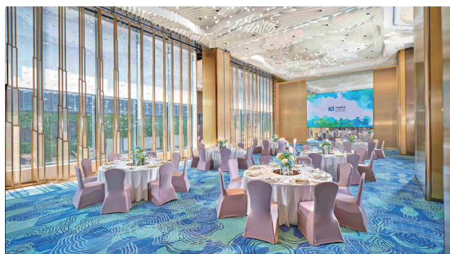
Emerald Banquet Hall