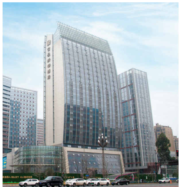
Regal Xindu Hotel and commercial/office towers - substantially completed