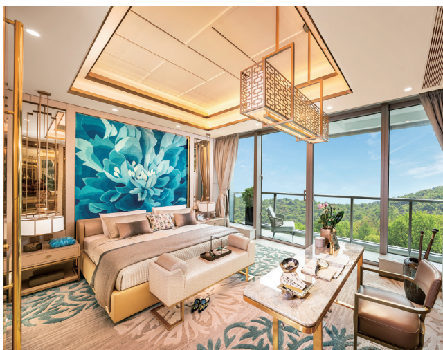
Master bedroom of a garden house