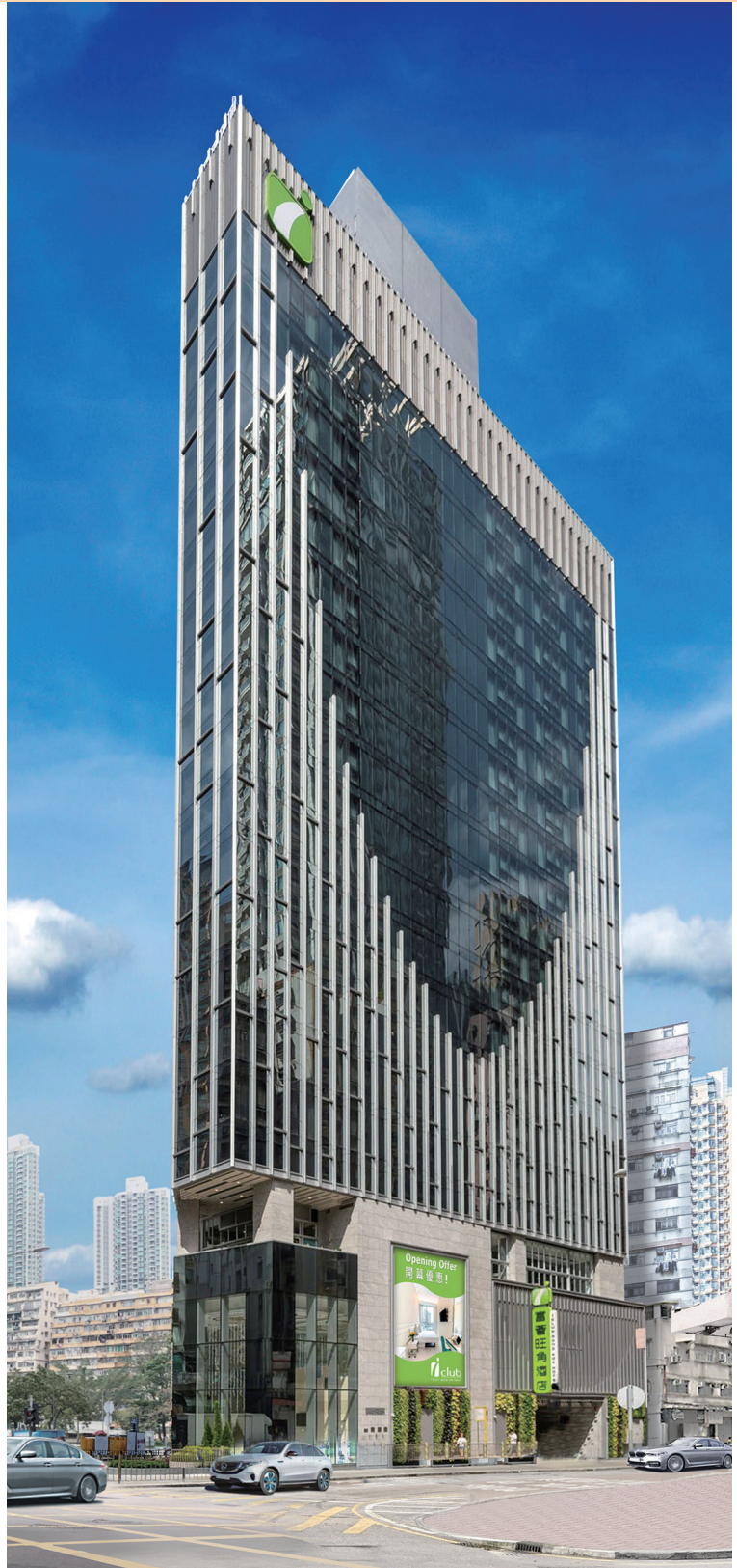
iclub Mong Kok Hotel at 2 Anchor Street, Mong Kok, Kowloon, Hong Kong