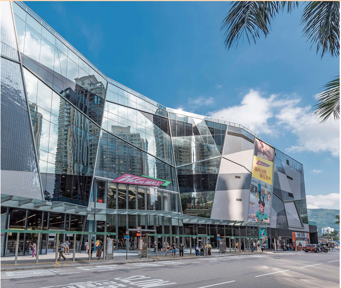
We Go MALL, a shopping mall at No. 16 Po Tai Street, Ma On Shan, Sha Tin, New Territories