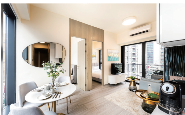
Living room of a flat