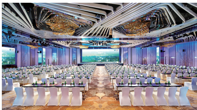
Regala Grand Ballroom