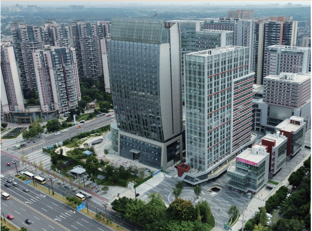
Regal Cosmopolitan City - Regal Xindu Hotel and commercial/office towers