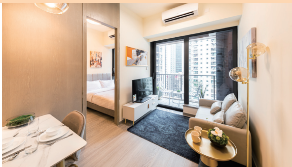
Living room of a flat