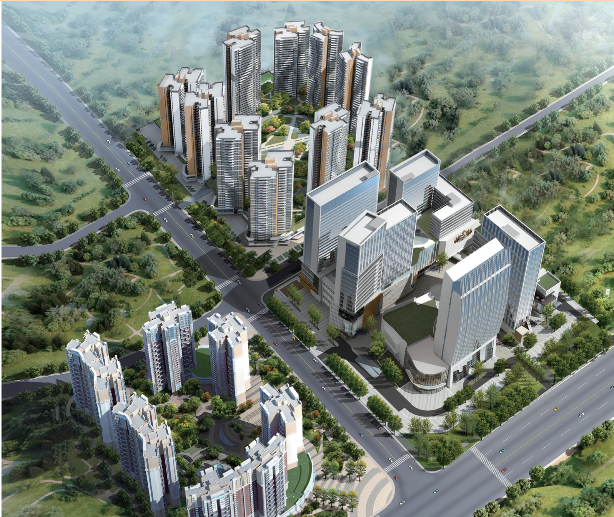
Regal Cosmopolitan City, a composite residential/commercial/office/hotel development in Xindu District, Chengdu, Sichuan (*)