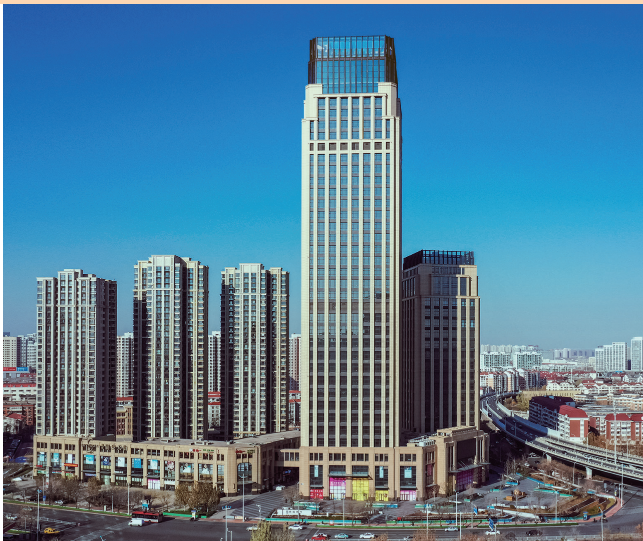
Regal Renaissance, a composite commercial/office/residential development in a prime location of Hedong District, Tianjin