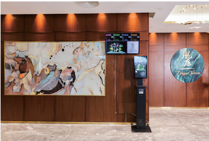
Chinese restaurant - Dragon Terrace