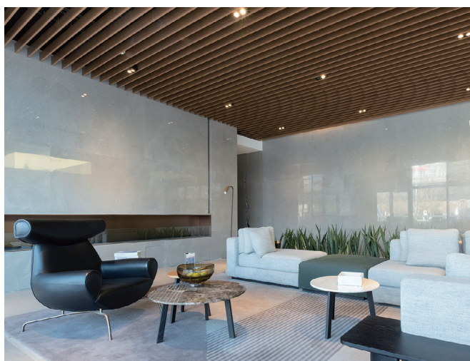
Lobby of an office tower