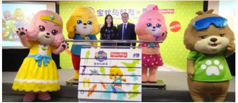
■ Announcement of Strategic Collaboration with Fisher-Price in Shanghai