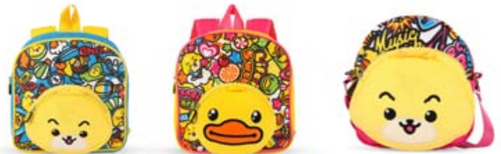
■ Strategic Collaboration with B.Duck