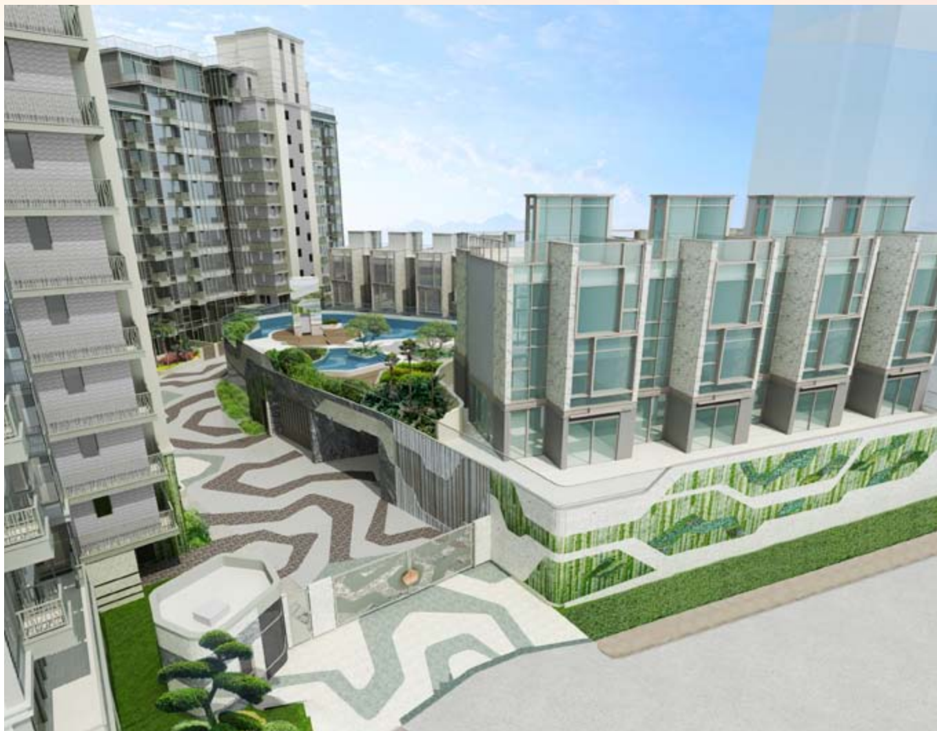
■ Luxurious residential development at Sha Tin Town Lot No. 578, Area 56A, Kau To, Sha Tin, New Territories – superstructure works in progress (*)