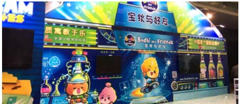
■ Participated in China Licensing Expo in Shanghai, China