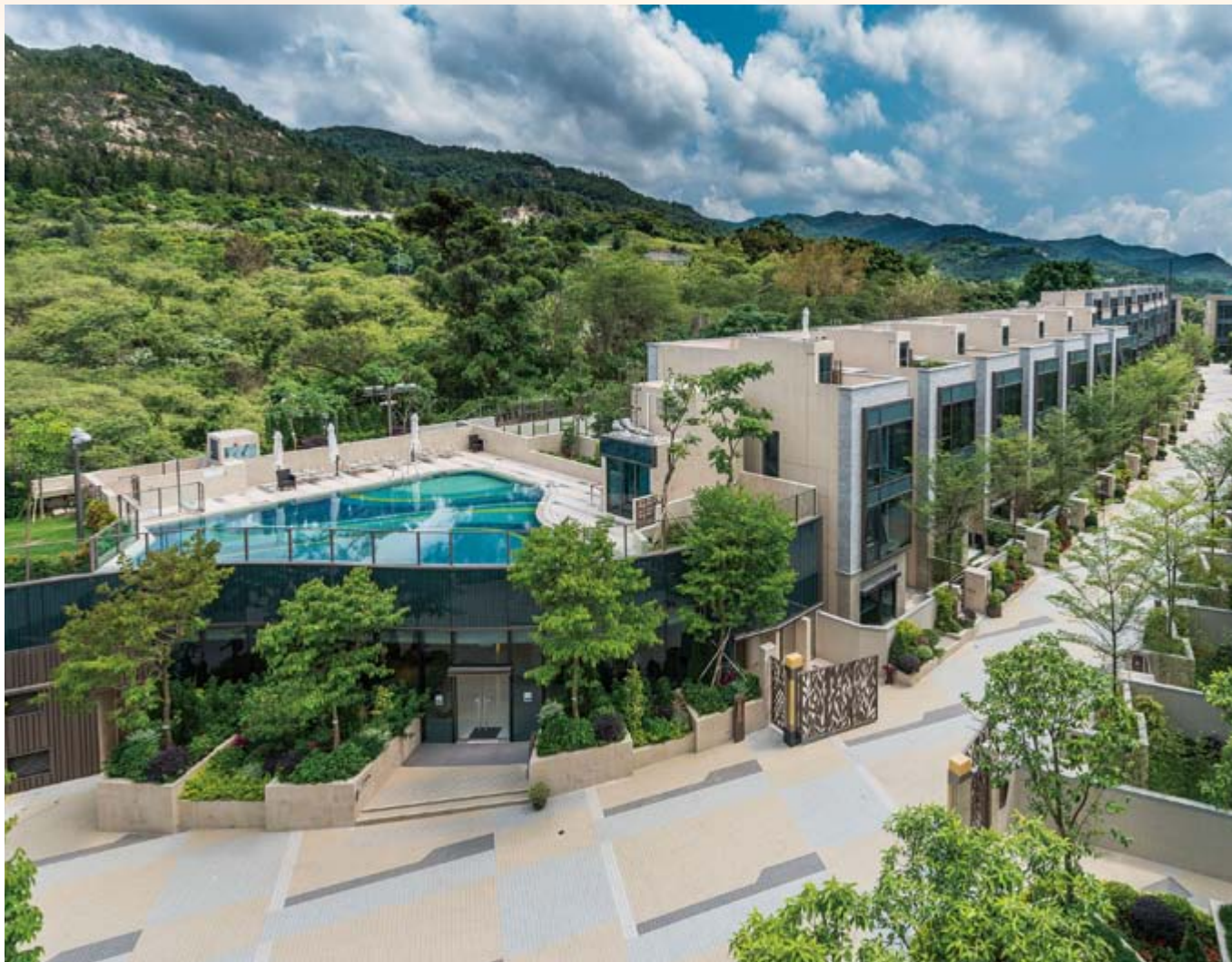
■ Casa Regalia, the garden houses in the residential development at Nos. 65-89 Tan Kwai Tsuen Road, Yuen Long, New Territories