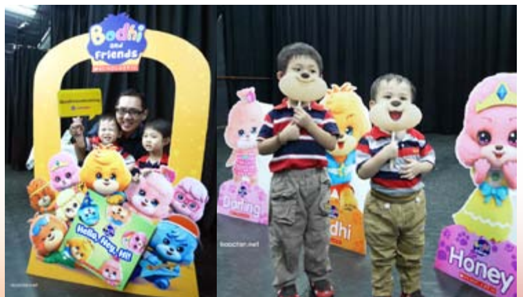
■ Scholastic's Books Preview Party in Malaysia