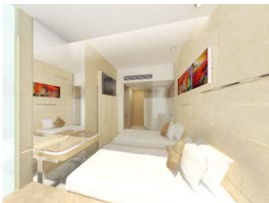
■ iPlus (*)