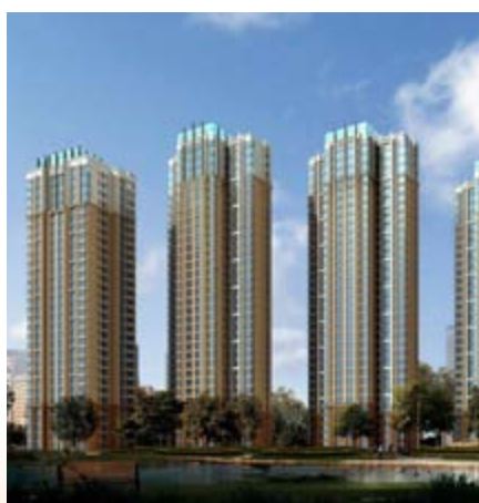
■ Residential towers of Regal Renaissance – superstructure works nearing completion (*)