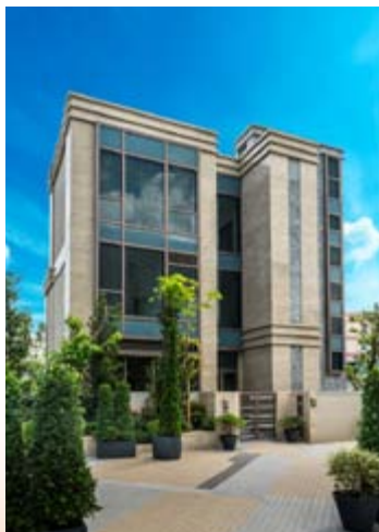
■ A luxurious garden house at Casa Regalia