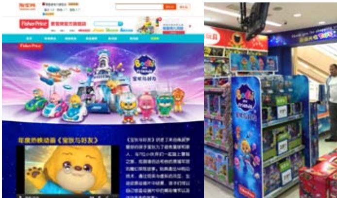
■ Bodhi and Friends toys available in retail outlets in China and Fisher-Price Tmall store