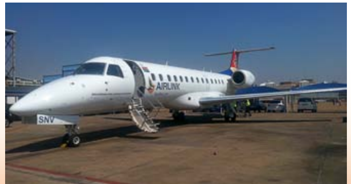
■ ERJ-135 Embraer Aircraft