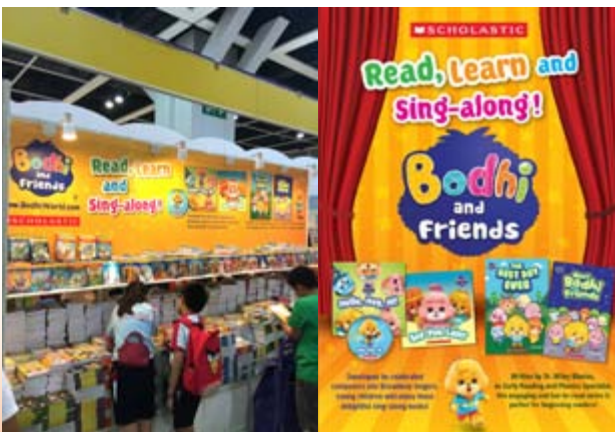
■ Scholastic's Books presents in Hong Kong