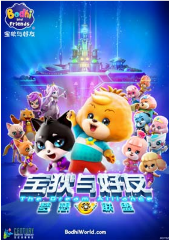
■ Bodhi and Friends flagship animation series