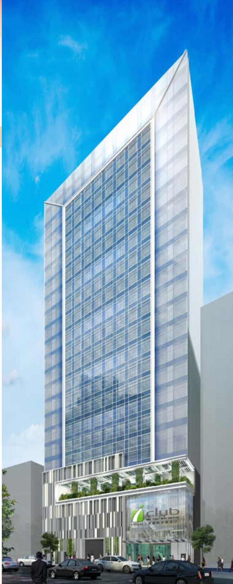
■ iclub Ma Tau Wai Hotel at Nos. 8, 8A, 10, 10A, 12 and 12A Ha Heung Road, To Kwa Wan, Kowloon – occupation permit already issued (*)