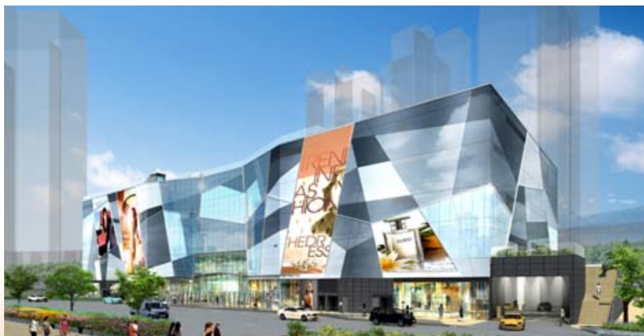
■ The shopping mall at Sha Tin Town Lot No. 482 at Po Tai Street, Ma On Shan, Sha Tin, New Territories – superstructure works nearing completion (*)