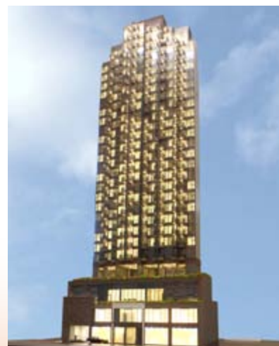
■ The Ascent, a commercial/residential development at No. 83 Shun Ning Road, Sham Shui Po, Kowloon – superstructure works in progress (*)