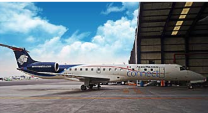
■ ERJ-145 Embraer Aircraft