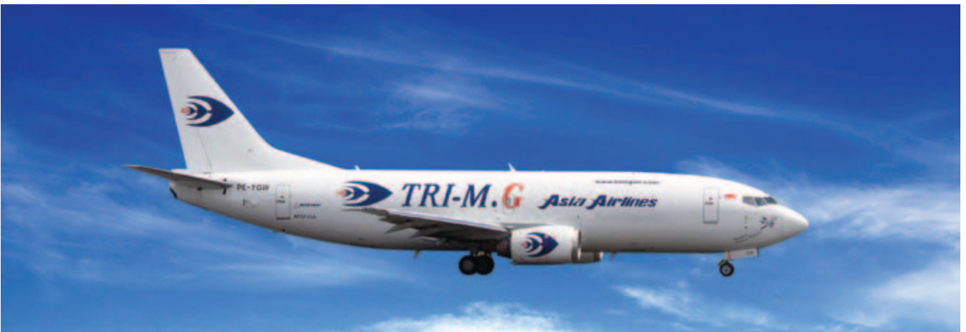
■ Boeing 737-33A(SF)