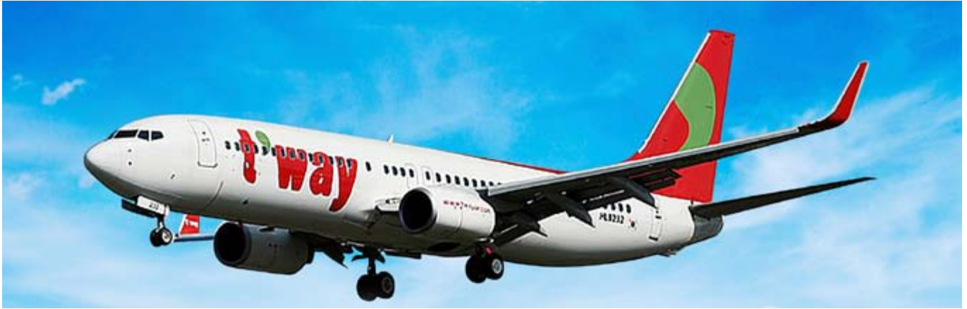
■ Boeing 737-800