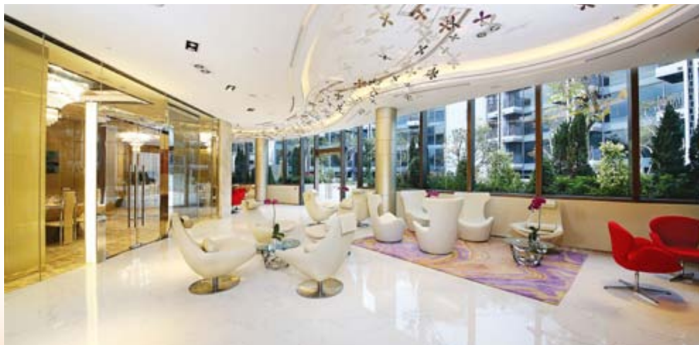
■ Club house of Casa Regalia and Domus in the Tan Kwai Tsuen Road development