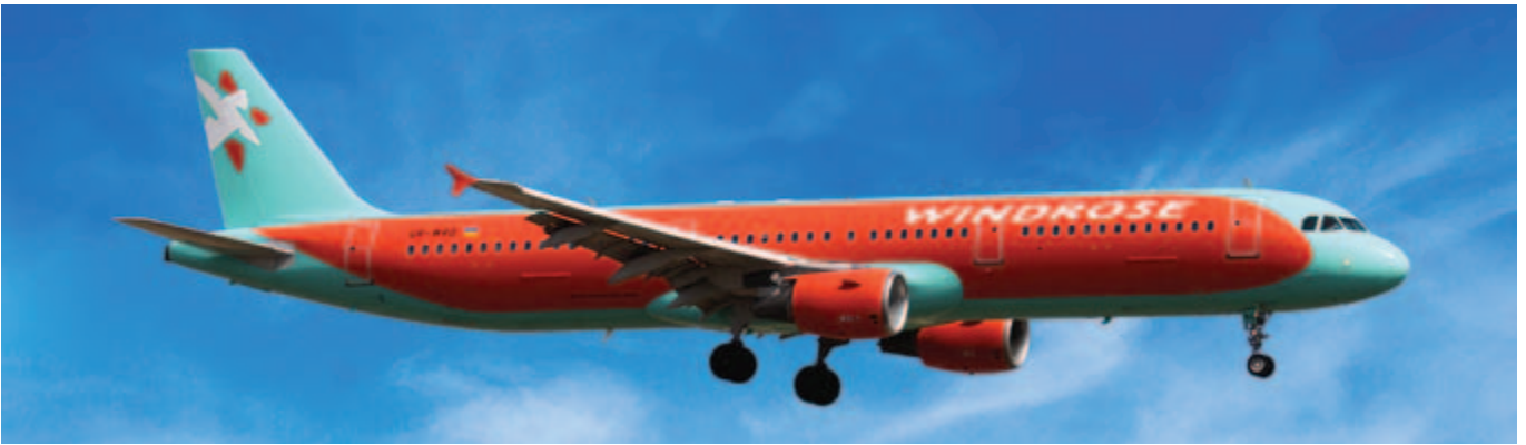
■ Airbus A321-211