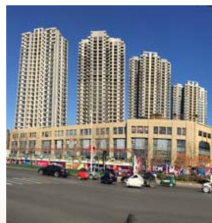
■ Residential and commercial portions of Regal Renaissance (*)