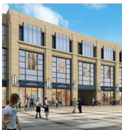
■ Regal Sky Walk, a shopping street in Regal Renaissance (*)