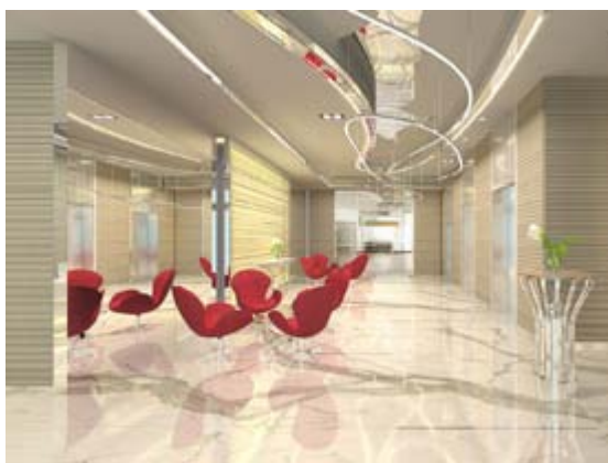
■ Hotel Lobby (*)