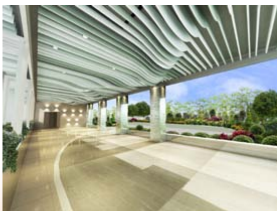
■ iLounge (*)