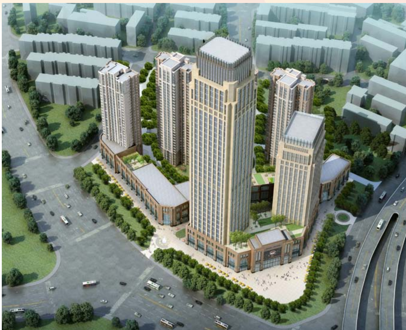
■ Regal Renaissance, a composite commercial/office/residential development in a prime location of Hedong District, Tianjin (*)