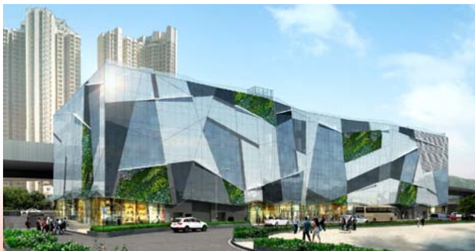
■ The shopping mall at Sha Tin Town Lot No. 482 at Po Tai Street, Ma On Shan, Sha Tin, New Territories – foundation works completed (*)