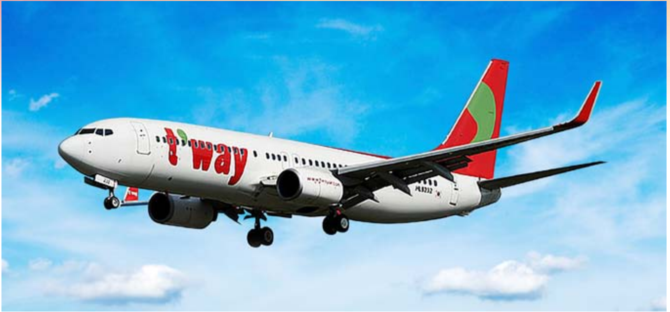
■ Boeing 737-800