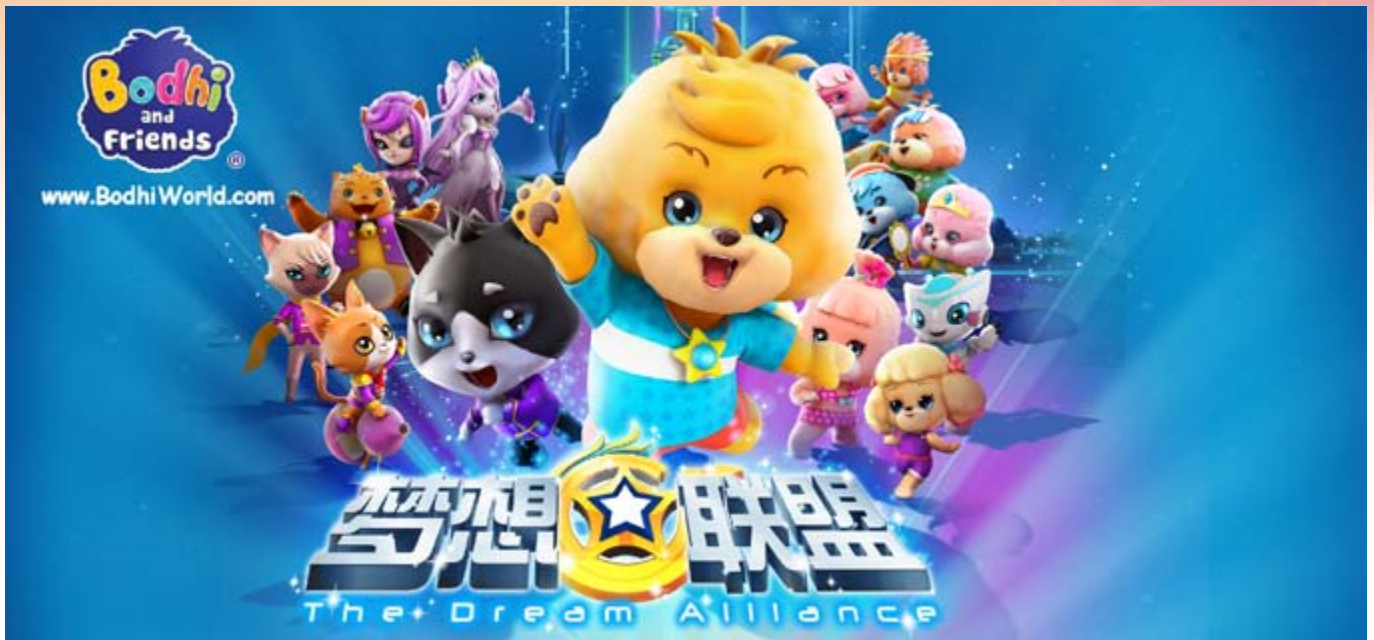
■ Bodhi and Friends flagship animation series