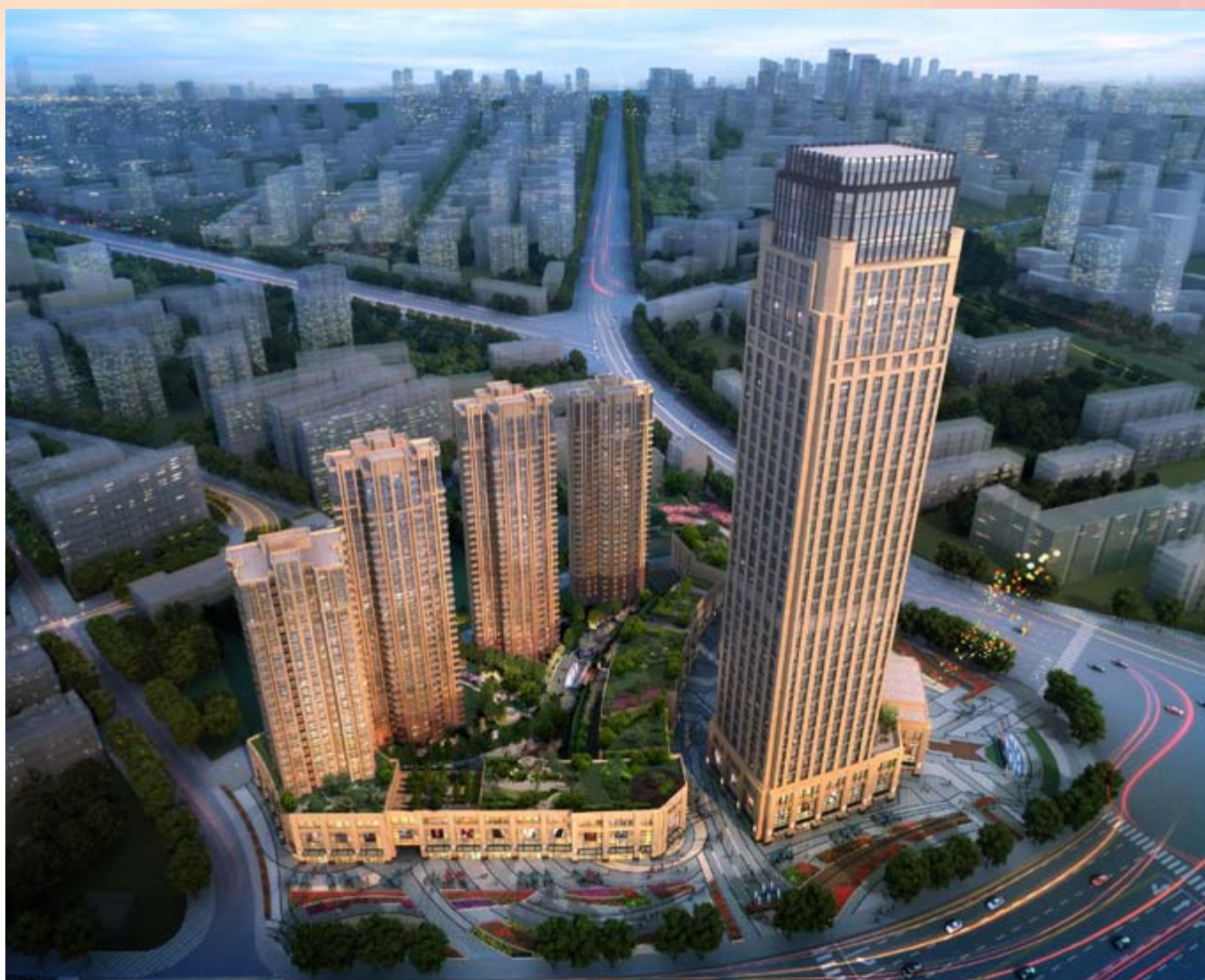
■ A composite commercial/office/residential development in a prime location of Hedong District, Tianjin (*)