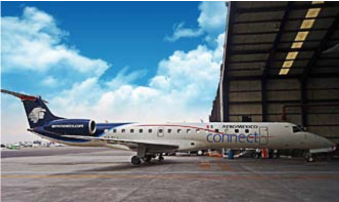
■ ERJ-145 Embraer Aircraft