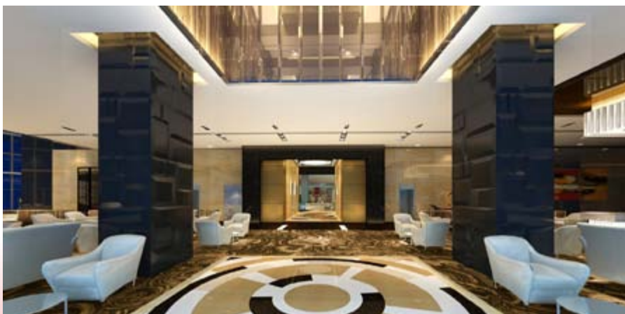
■ Lobby lounge of Regal Xindu Hotel (*)