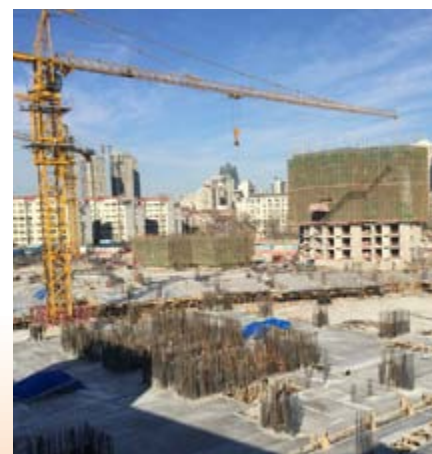
■ Superstructure works of the residential towers of the composite development in progress