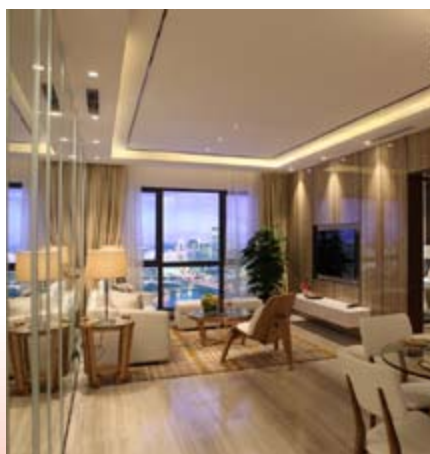
■ Show flat in modern western style of residential apartment in the composite development