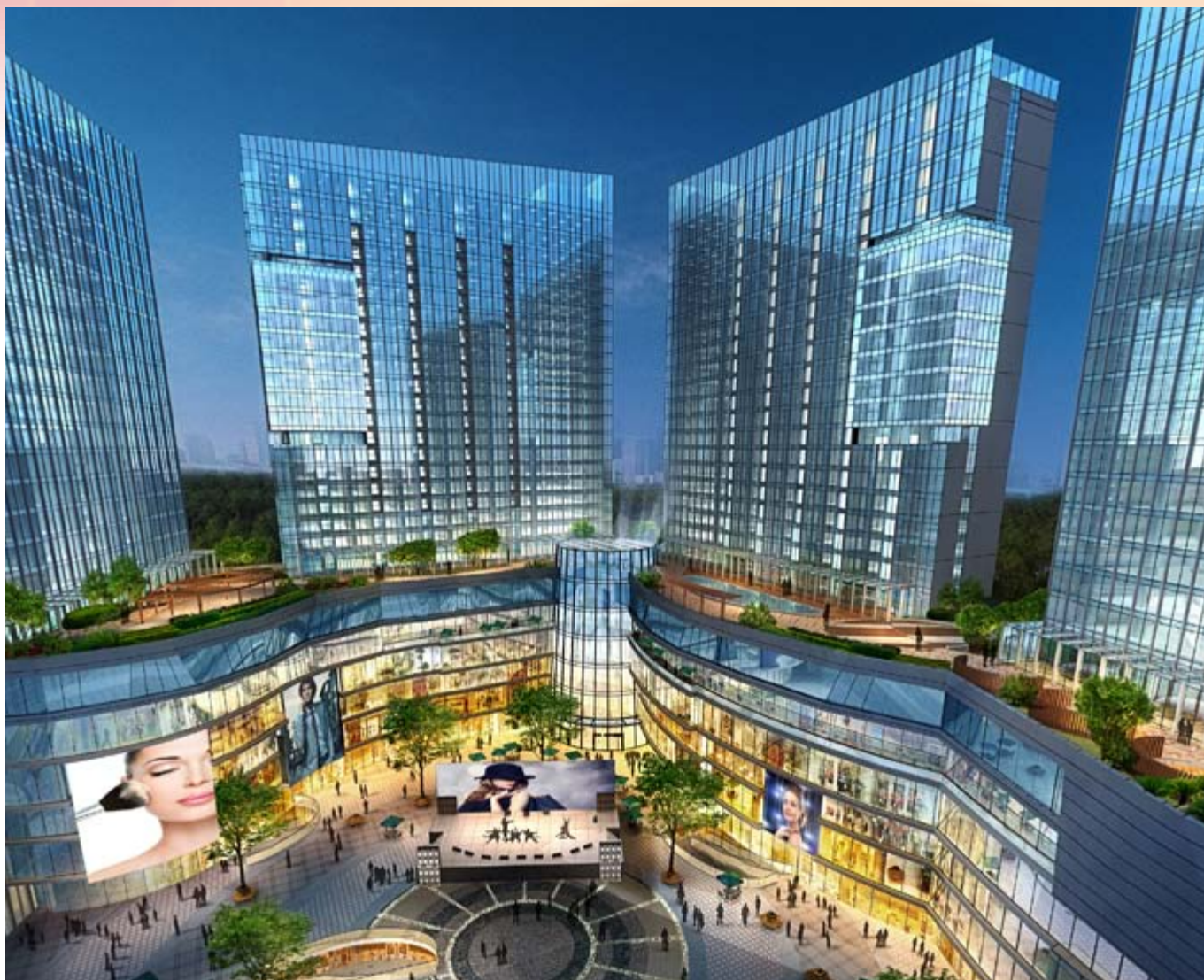
■ The shopping mall and commercial towers in the first stage of the composite development in Xindu District, Chengdu, Sichuan (*)