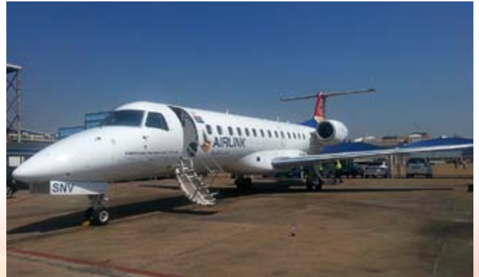
■ ERJ-135 Embraer Aircraft