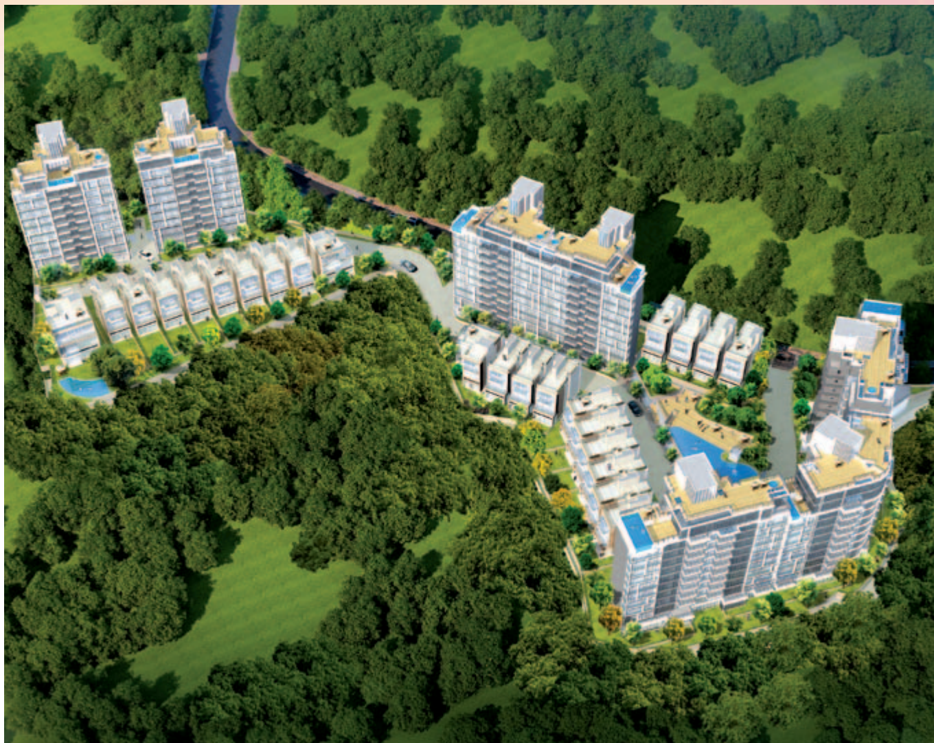
■ Luxurious residential development at Sha Tin Town Lot No. 578, Area 56A, Kau To, Sha Tin, New Territories – foundation works in progress (*)