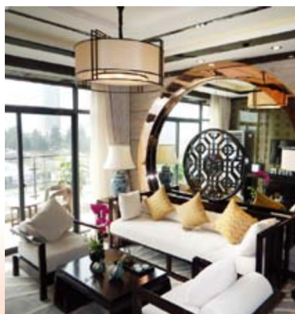
■ Show flat in modern Chinese style of residential apartment in the composite development