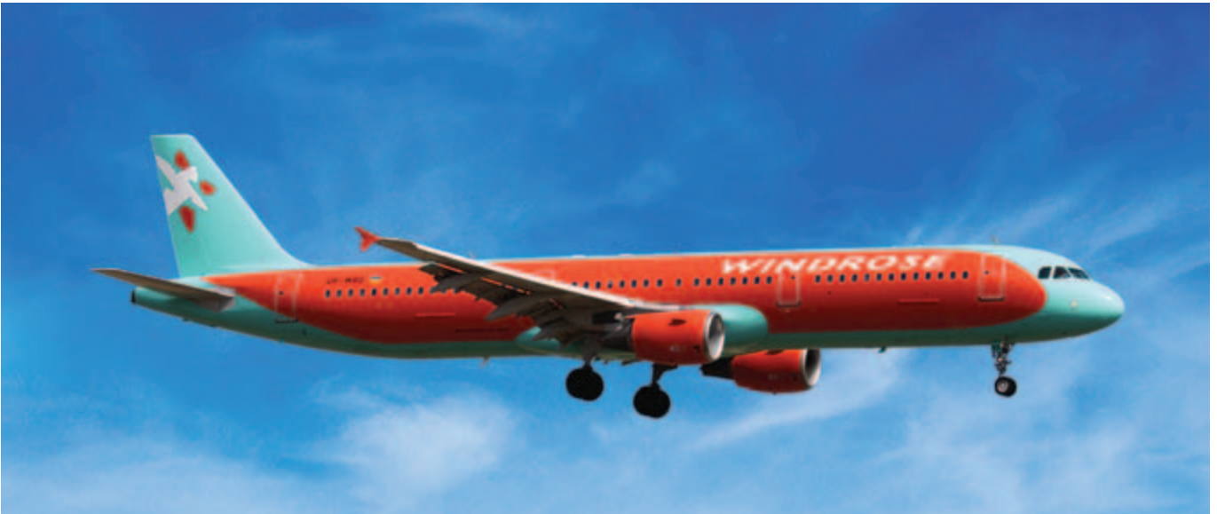
■ Airbus A321-211