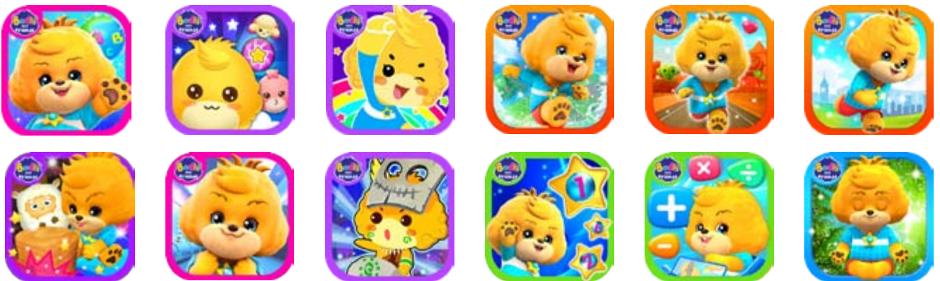
■ Bodhi and Friends mobile educational APPs