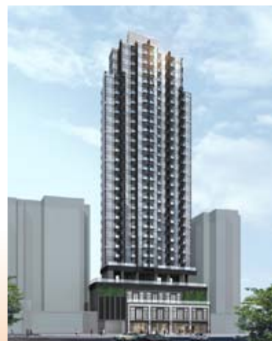
■ Commercial/residential development at Nos. 69-83 Shun Ning Road, Sham Shui Po, Kowloon – superstructure works in progress (*)