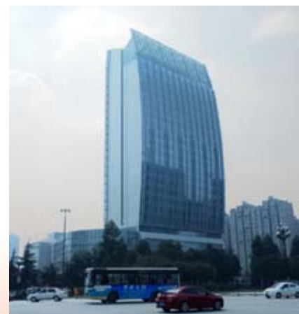
■ Regal Xindu Hotel, a five-star hotel in the first stage of the composite development – superstructure works completed