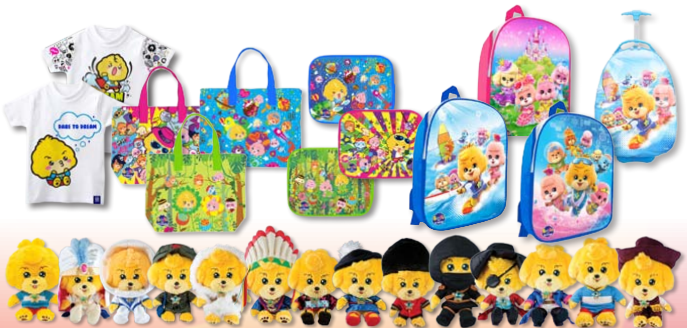
■ Bodhi and Friends toys and stationery products